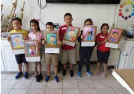
Fellsmere School Trip

The Eggert Children’s Gallery is a partnership program with schools to showcase the art of students in our community.