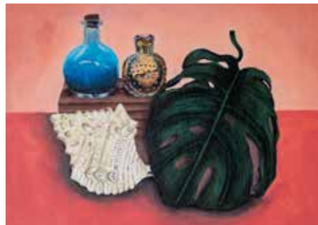
Indian River County Juried Student Show