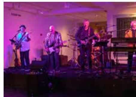
GALA band Cactus Jack and the Cadillacs