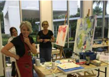
Museum Art School Class