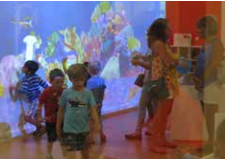
The Art Zone