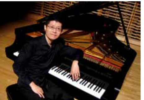
Atlantic Classical Orchestra