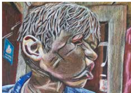
Indian River County Juried Student Show