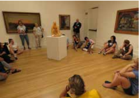
A+ Art Program