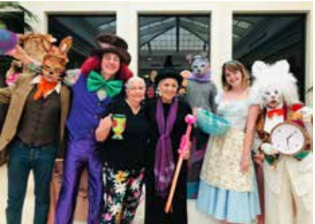
Children’s Art Festival