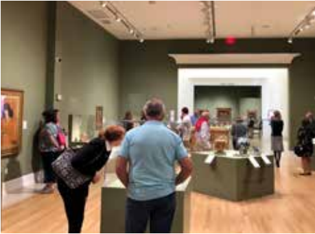
Victorian Radicals Member’s Opening