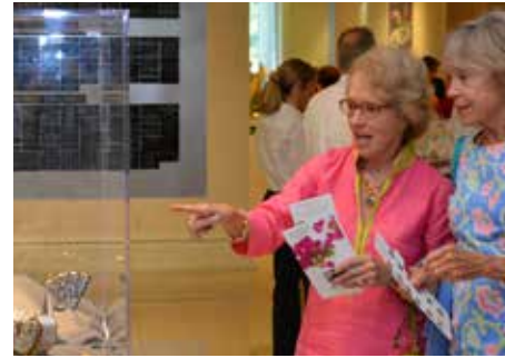
Art In Bloom 2019