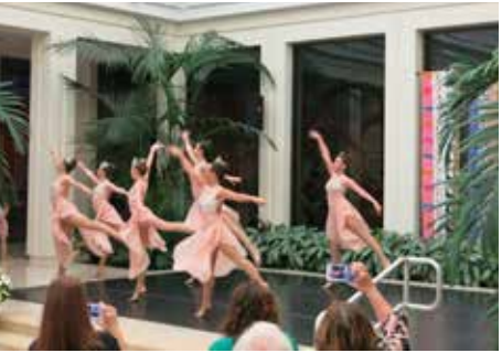
Holidays at the Museum