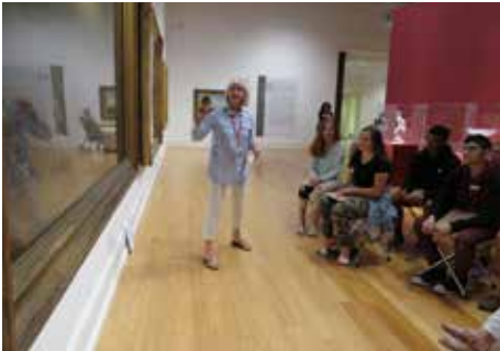
Master's Academy School Fieldtrip