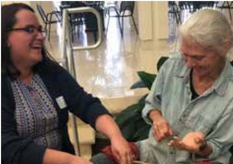
Teacher CCR Class