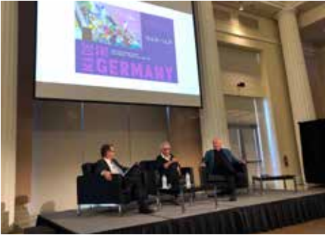
Made in Germany members-opening reception

Friends of the Vero Beach Museum of Art is the collective name for all Museum volunteers and their various functions and specialized services.