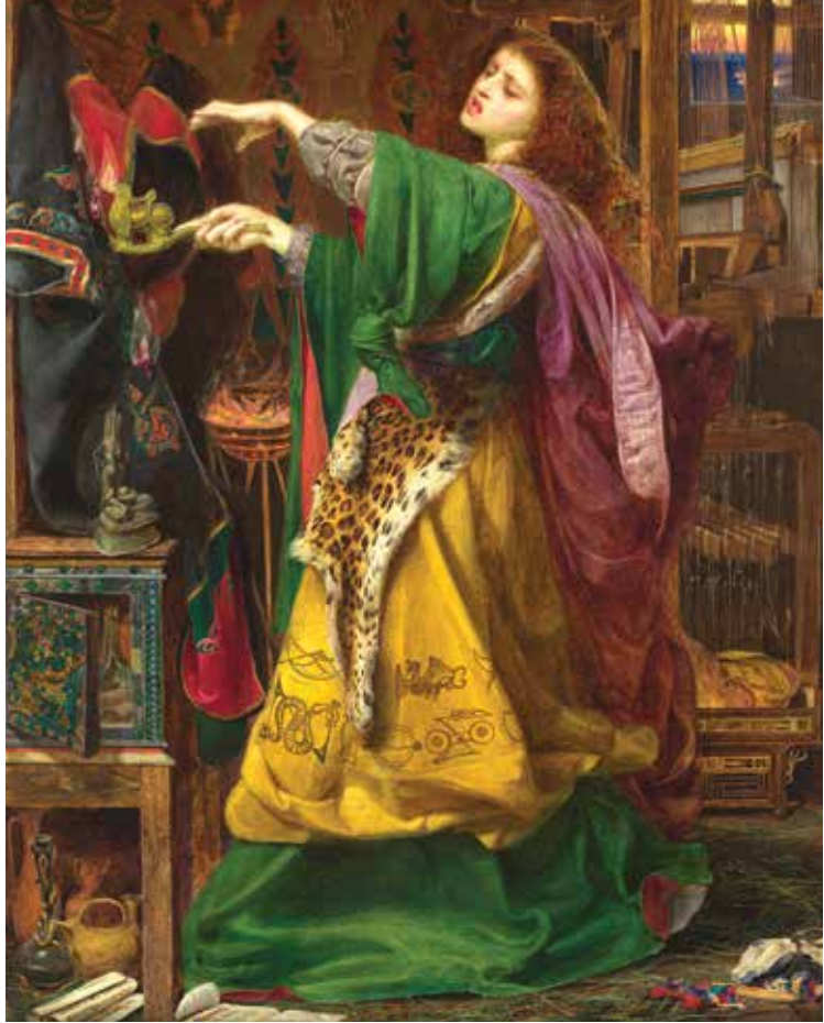
Top Left: Designed by William Frend De Morgan, manufactured by Merton Abbey Pottery, Peacock vase , ca. 1885, Earthenware, thrown and painted in colors over white slip, 13 9 / 16 x 4 1 / 2 in., Presented by Miss Bridget D'Oyly Carte © Birmingham Museums Trust Courtesy American Federation of Arts | Bottom Left: Designed by William Morris, printed by Thomas Wardle & Co. and sold by Morris & Co., "Kennet", design registered 1883, Indigo-discharge block-printed cotton, 24 5 / 8 x 37 15 / 16 in., Presented by the Friends of Birmingham Museums Trust, 1941 © Birmingham Museums Trust, Courtesy American Federation of Arts | Center: Frederick Sandys, Morgan le Fay , 1864, (detail), Oil on composite wood panel in original frame, 24 15 / 16 x 17 5 / 16 in. (unframed) and 45 11 / 16 x 39 9 / 16 x 5 3 / 8 in. (framed), © Birmingham Museums Trust, Courtesy American Federation of Arts | Right: Frederick Sandys, Medea , 1866-68, Oil on composite wood with gilding, 24 1 / 16 x 17 15 / 16 in. (unframed), Presented by the Trustees of the Public Picture Gallery Fund, 1925 © Birmingham Museums Trust, Courtesy American Federation of Arts