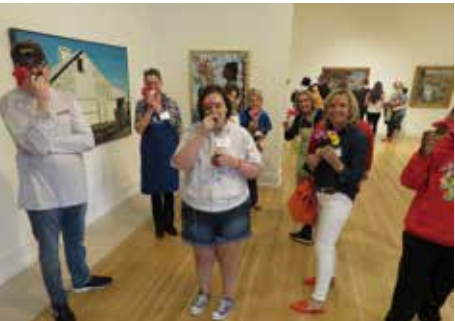
A+ Art Participants