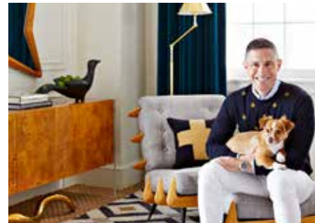
Fashion Meets Art event with Jonathan Adler