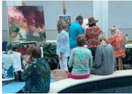
Museum Art School Open House