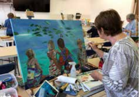
Museum Art School Class