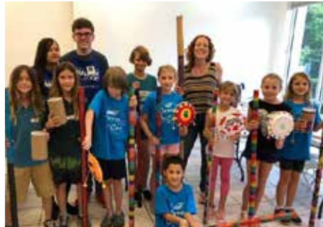
2018 Summer Art Camp