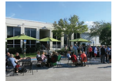
Celebrated successful conclusion of Endowment Campaign