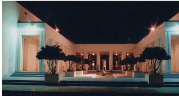
Name change to Vero Beach Museum of Art