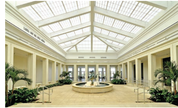
Laura and Bill Buck Atrium opens