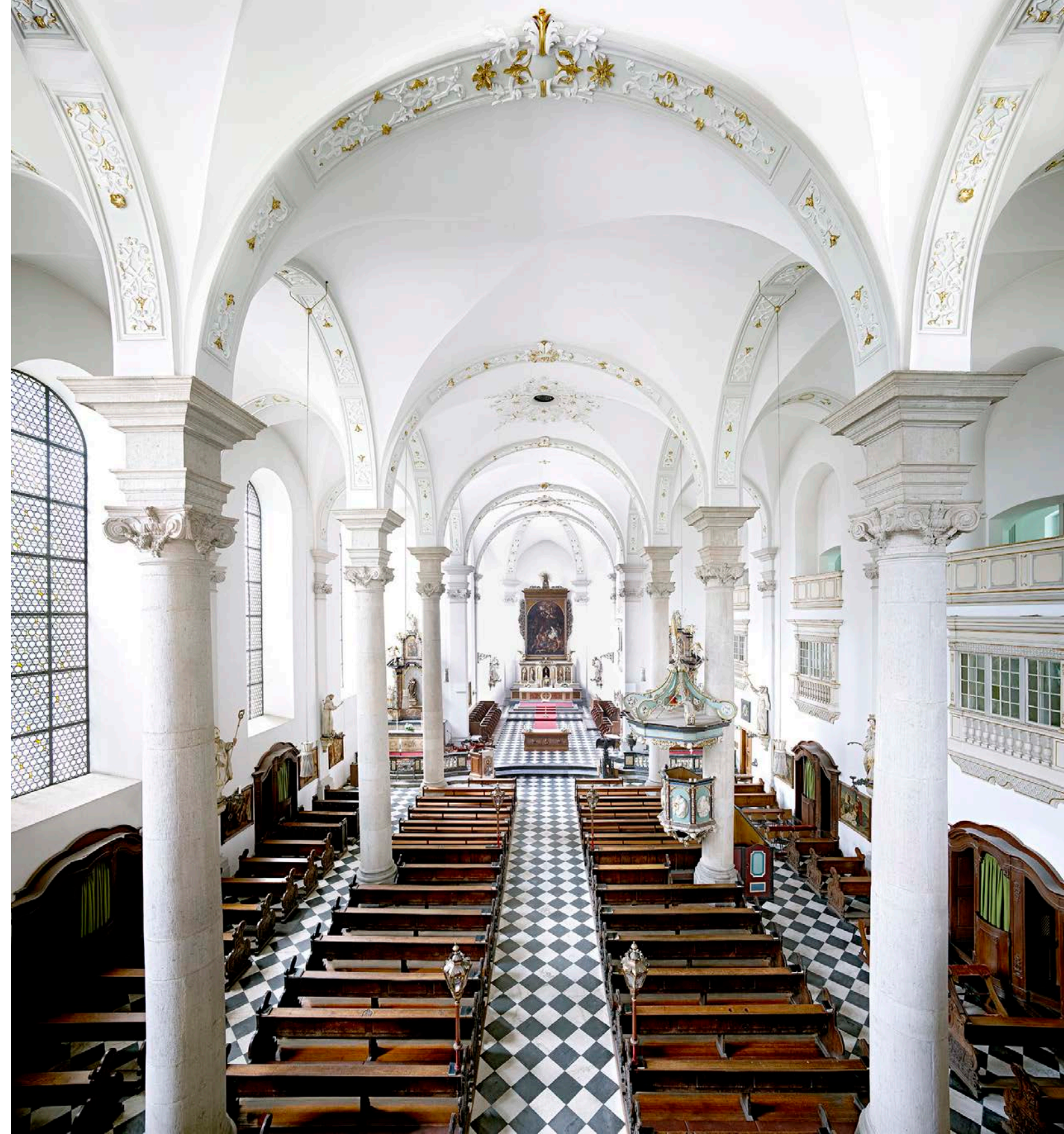
Candida Höfer, German (b. 1944), Sankt Maximilian Düsseldorf I , 2012, Chromogenic print, Paper: 70 7 / 8 x 67 1 / 2 inches, Framed: 72 7 / 8 x 69 1 / 8 inches, Edition 4 of 6 with 3 APs (#4/6), Museum Purchase with funds provided by the Athena Society, 2017.3

Additionally, the Museum will begin to project attendance for special exhibitions and tie this to admissions to better anticipate earned income. The new Director of Education will establish metrics to evaluate the impact of our broad array of community partnerships, collaborations, and educational programs. These metrics will be added to our plan in future iterations.