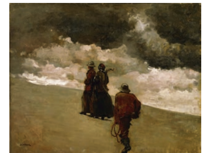
Winslow Homer, 1863-1910, To the Rescue , 1886, Oil on canvas, 24x30, from the Phillips Collection, Acquired 1926