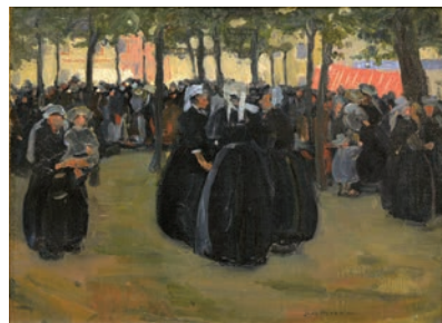
Museum accepted into Association of Art Museum Directors