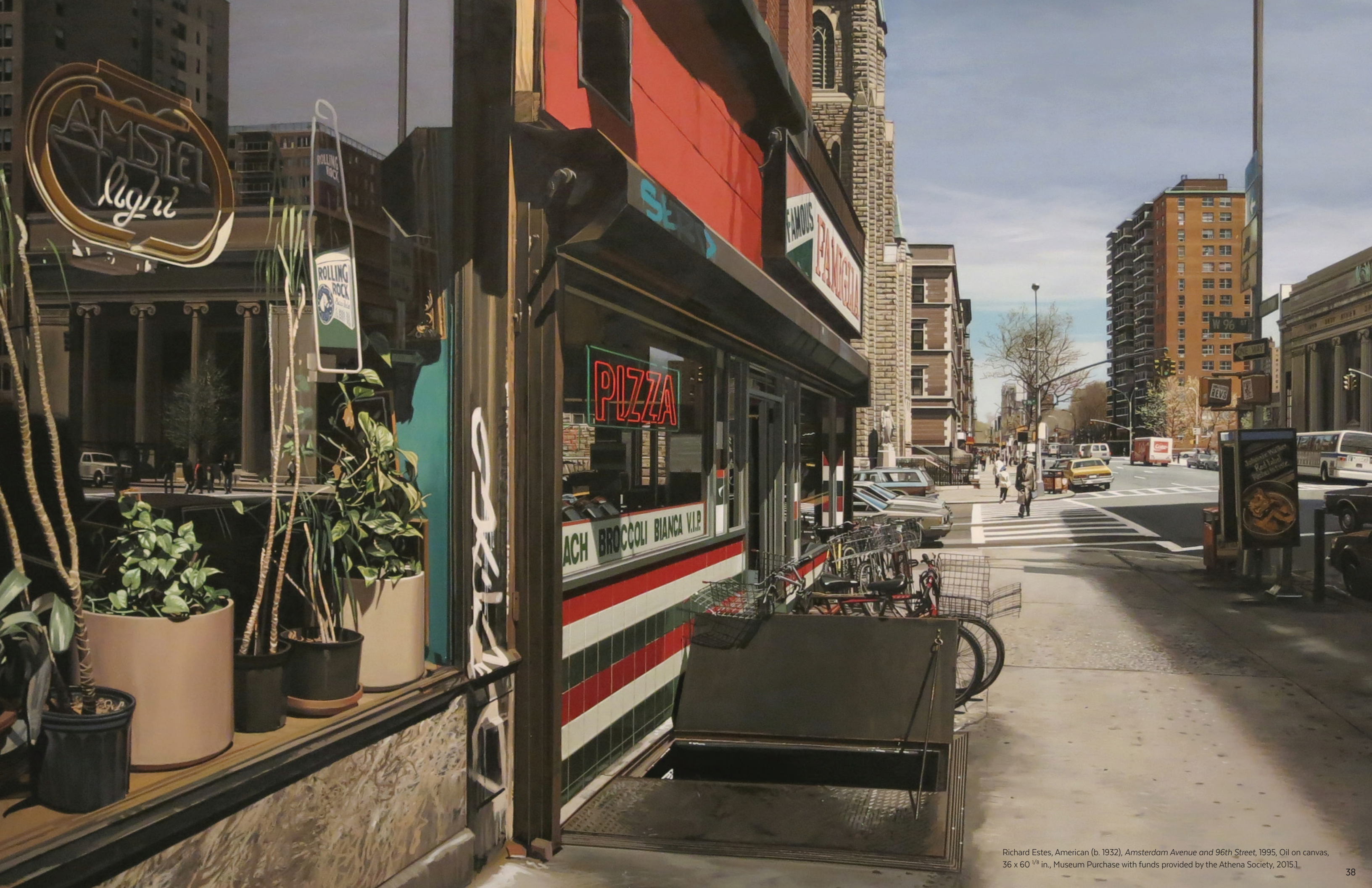
Richard Estes, American (b. 1932), Amsterdam Avenue and 96th Street , 1995, Oil on canvas, 36 x 60 1/8 in., Museum Purchase with funds provided by the Athena Society, 2015.1