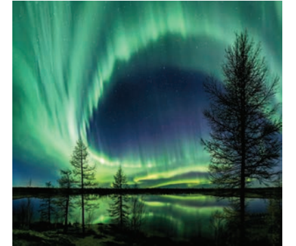
In Autumn Dance

Made in Germany: Art Since 1980 from the Rubell Family Collection FALL 2018