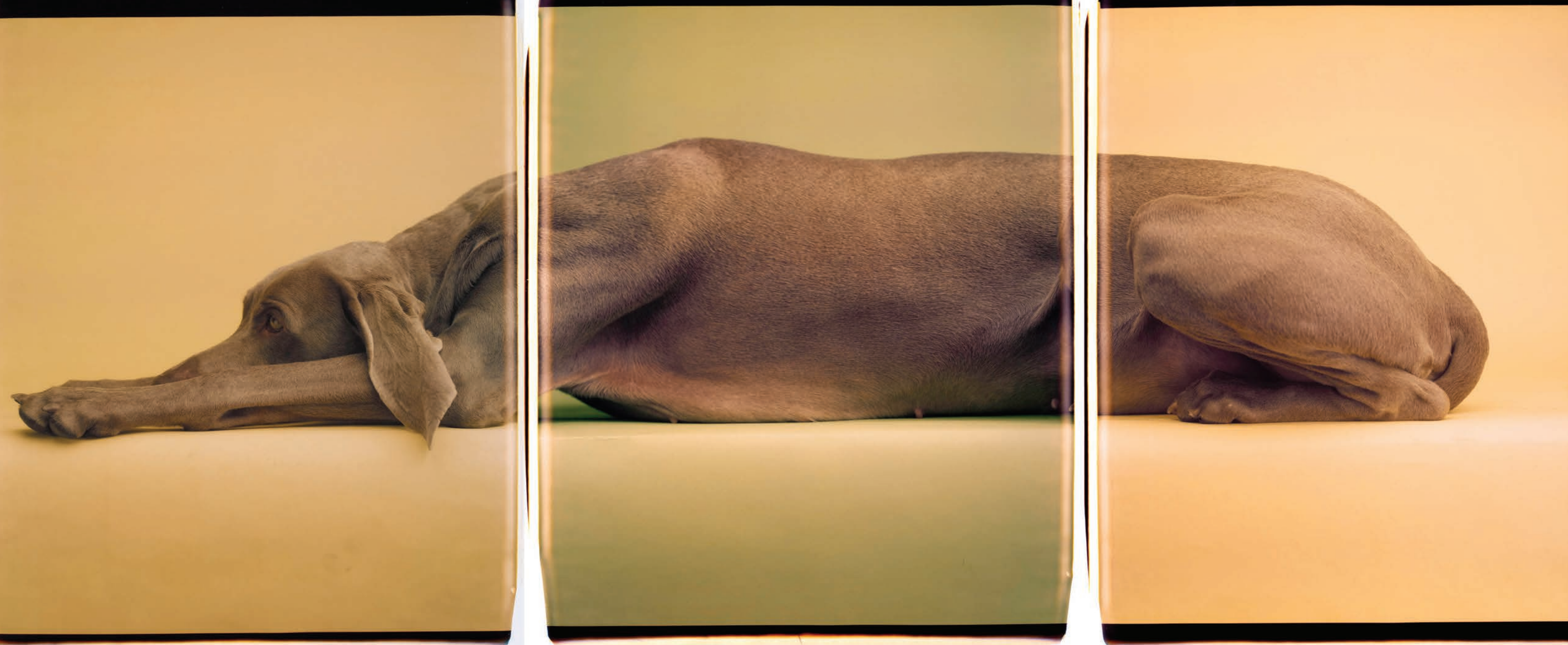
William Wegman, American (b. 1943), Lying Dog , 1994, Color Polaroid, 3 panels each 24 x 20 in.; overall 24 x 60 in. (framed) Museum Purchase with funds provided by the 20/20 Vision for the Future Fund, 2010.4