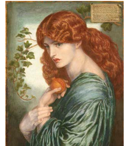
Dante Gabriel Rossetti, Proserpine , (detail), 1881-82 Oil on canvas, 39 3/16 x 24 3/16 in. Presented by the Trustees of the Public Picture Gallery Fund, 1927, © Birmingham Museums Trust, Courtesy American Federation of Arts

L'Affichomania: The Art of French Posters FALL 2020