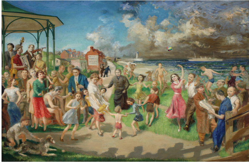
Doris Lee, The Beach Party , c. 1932, Oil on canvas, 37 1/2 x 50 3/4 inches, Private Collection