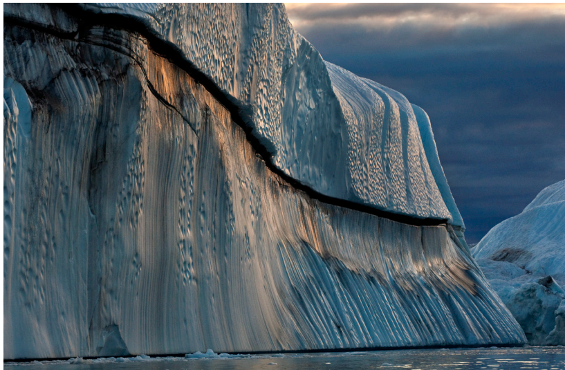
Balog, James, Copper Iceberg, Ilulissat Isfjord, Greenland , 2007, Pigment print on archival paper, 33 x 50 inches

Simple Pleasures: The Art of Doris Lee features 74 of the most notable and compelling works of art by Doris Lee (1905-1983). Using a vibrant color palette, Lee sparks feelings of playfulness and humor in her paintings, drawings, prints, and commissioned commercial designs for fabric and pottery. Simple Pleasures includes works by the artist spanning from the 1930s through the 1960s from both public and private collections and gives overdue recognition to Lee's significant contributions to American art.