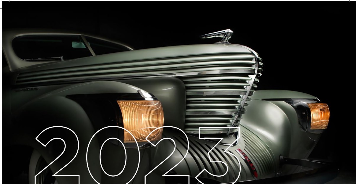
1939 Graham-Paige Sharknose Combination Coupe Charles Mallory, Greenwich, CT