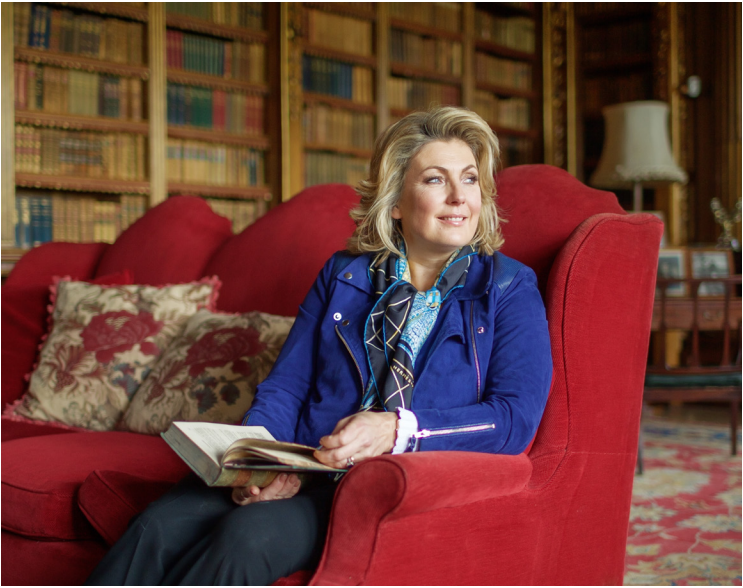
Lady Fiona Carnarvon