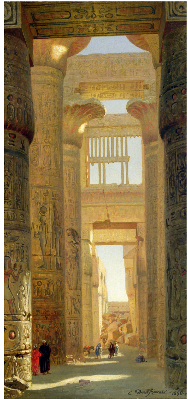
Ernst Karl Eugen Koerner, The Temple of Karnak, The Great Hypostyle Hall , 1890, Oil on canvas, 31 1/4 x 18 1/4 in., Dahesh Museum of Art, New York, 1995.114