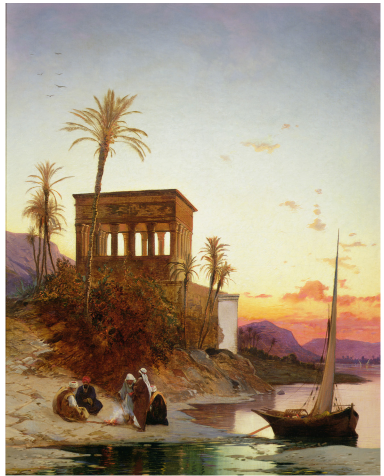
Hermann David Salomon Corrodi, Campfire by the River: Kiosk of Trajan at Philae , ca. 1880, Oil on canvas, 33 x 25 1/2 in., Dahesh Museum of Art, New York, 1995.20

This exhibition was organized by the Dahesh Museum of Art, New York City. To celebrate the centennial of archaeologist Howard Carter's discovery of the tomb of King Tutankhamun, the VBMA will present this extraordinary exhibition from the Dahesh Museum in New York. The show will explore artistic visions of the cultures and peoples from the time Napoleon entered Egypt, taking with him dozens of draftsmen and engineers to create renderings of this country's rich cultural phenomena. The exhibition will feature paintings, sculptures, and illustrated books by a diverse group of artists, many of whom were academically trained, having learned to draw and paint from life, and sketch directly from nature.