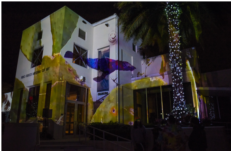
Art After Dark , December 2022, Vero Beach Museum of Art