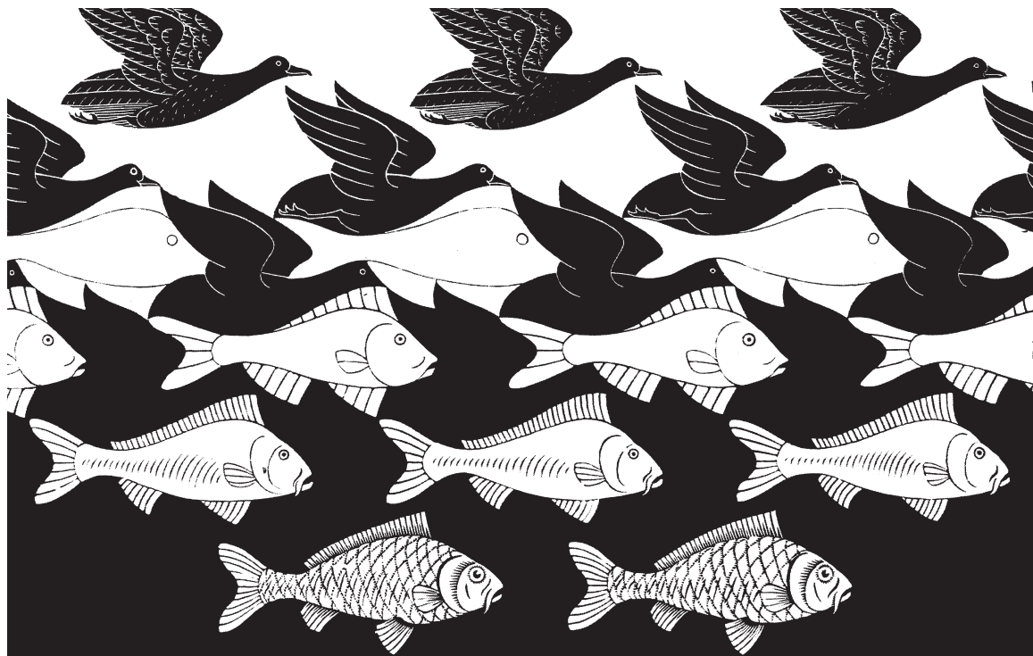
M.C. Escher, Sky and Water I , (detail), 1938. Woodcut, 43.5 x 43.9 cm. Private Collection, Image copyright of the M.C. Escher Co.