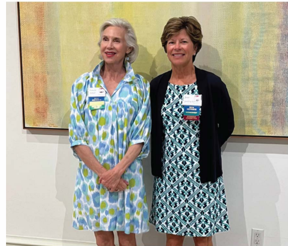
Alzheimer & Parkinson Association