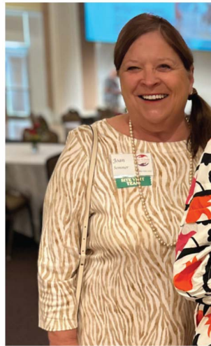
Senior Resource Association