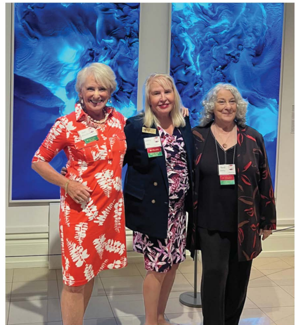
PreK at the VBMA!