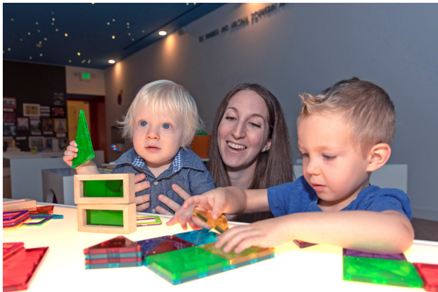
Programs in the ArtZone

By joining The Circle, you become part of a unique, engaged group of Museum supporters and friends. As a member, you will help determine which of the Museum's community outreach initiatives The Circle will fund each year. We are committed to advance and expand the Museum's programs, "Enhancing Lives, Through Art."