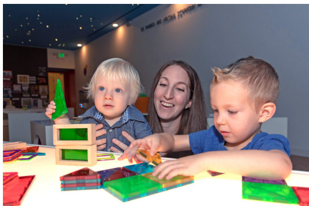
Programs in the ArtZone

By joining The Circle, you become part of a unique, engaged group of Museum supporters and friends. As a member, you will help determine which of the Museum's community outreach initiatives The Circle will fund each year. We are committed to advance and expand the Museum's programs, "Enhancing Lives, Through Art."